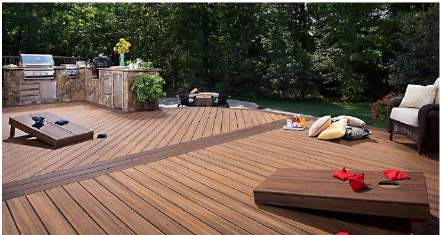
Trex Havana Gold