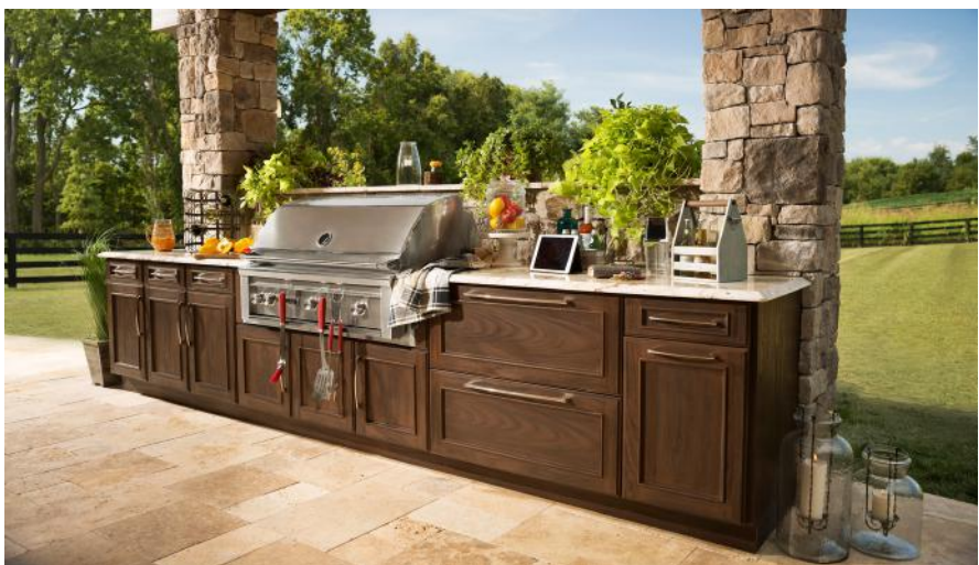
Trex Outdoor Kitchen